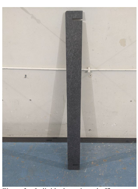
Figure 3 – Individual specimen baffle