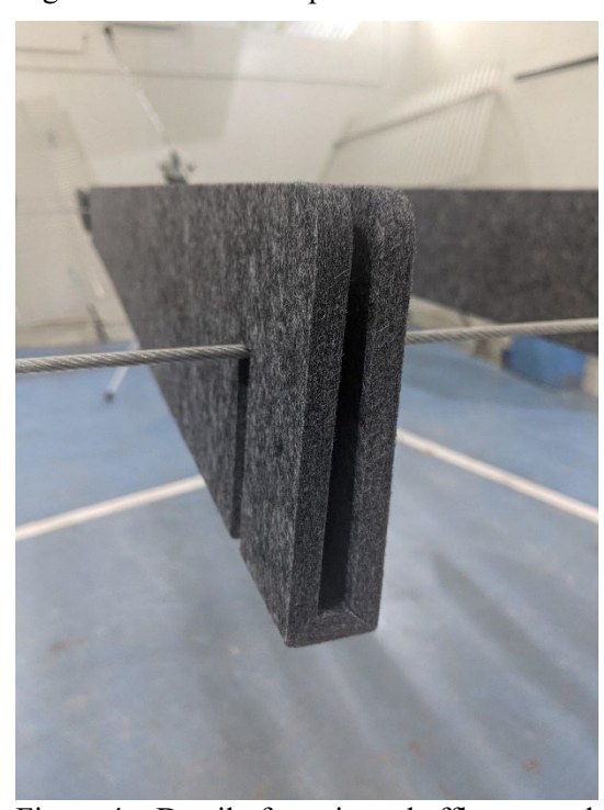
Figure 4 – Detail of specimen baffle suspended from cables using notches